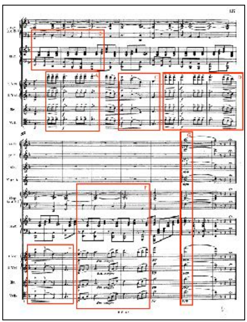
Fig. 1: P. Mascagni, "Intermezzo" from Cavalleria Rusticana Red box labels correspond to the superscripts in Example 2.

orchestra repeats the same four bars<sup>D,E</sup> -- just as it has done with twobar phrases earlier in the piece. Yet something is different this time. Six bars from the end, the organ and harp have changed their tune. They're slower, and the strings are quieter somehow. F They climb, quieter and higher, quieter and higher, as only a string section can do--and when they arrive, higher than they've ever gone in the piece, two